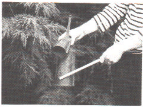
This is a double bell called the Gankogui (pronounced gang-cog-

Hatsiatsia is performed by the people of the Ewe tribe (pronounced Eh-vay). The Ewe are the main people from the south east of Ghana. Everyone takes part. Perhaps 100 people or more form a large circle, often around a tree that provides shade from the hot sun. A bucket of water is blessed and placed just inside the circle. A slow, shuffling dance step gradually takes everyone past the bucket and people dip their hands or a handkerchief into it, wiping their faces with the water. Sometimes someone will rush up to the bucket, cup their hands, scoop the water and throw it over as many people as possible. This ceremony is a chance to forgive and forget all the arguments you have had with friends and family during the last month - they are washed away. The music is played on two types of metal bell. The bells are quite heavy and are made from iron.