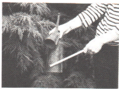
This is a double bell called the Gankogui (pronounced gang-cog-

Music is played on two types of metal bell. These are heavy and made of iron. (see pictures below).